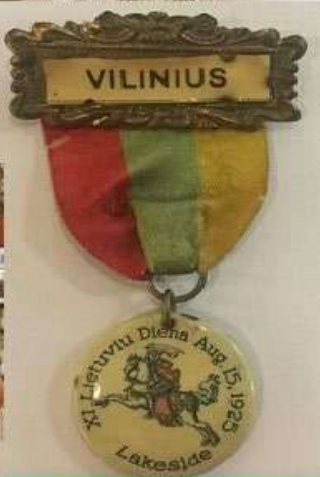
Scenes from past Lithuanian Days at Lakewood Park