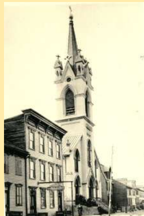
St. Joseph's Church

The coal regions of Schuylkill County quickly became known as Little Lithuania.